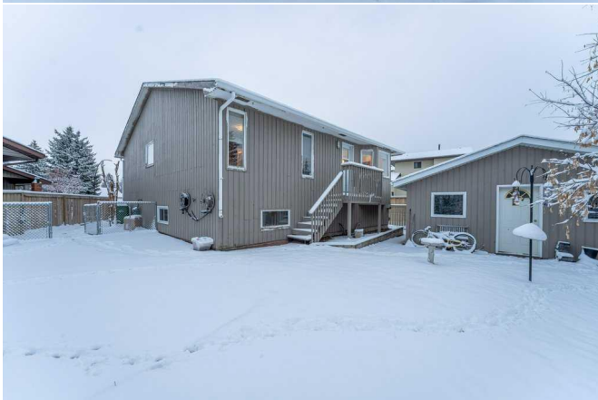
68 Bedford Cir NE, Calgary, AB

2nd Floor Exterior Area 1362.17 sq ft Interior Area 1272.72 sq ft