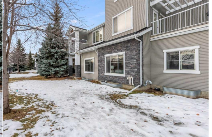
106 Cougar Ridge Dr SW, Calgary, AB