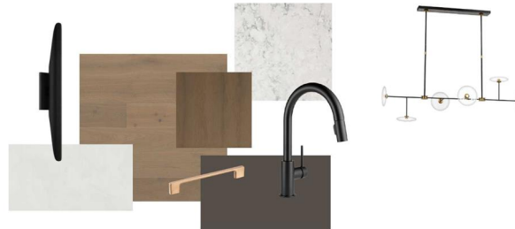
KITCHEN SELECTIONS 2611 25 th Street - Left Side Residence