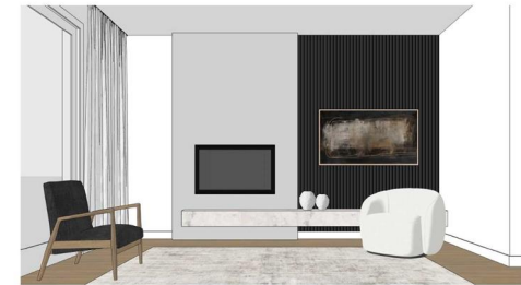
FIREPLACE CONCEPT - 3D VIEW 9611 95 th Street - Left Side Residence