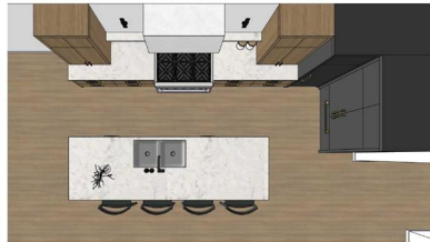
KITCHEN CONCEPT - FLOOR PLAN 9611 95 th Street - Left Side Residence