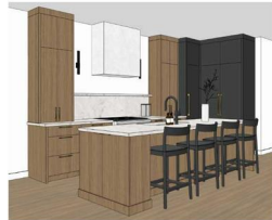
LORI SELLMER design