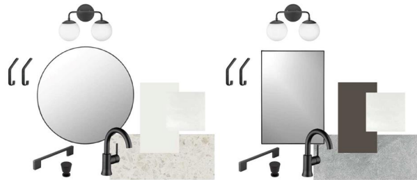
MAIN | BASEMENT BATHROOM SELECTIONS 2611 25 th Street - Left Side Residence