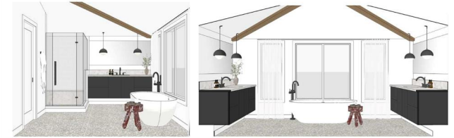
PRIMARY ENSUITE CONCEPT - 3D VIEW 2611 25 th Street - Left Side Residence