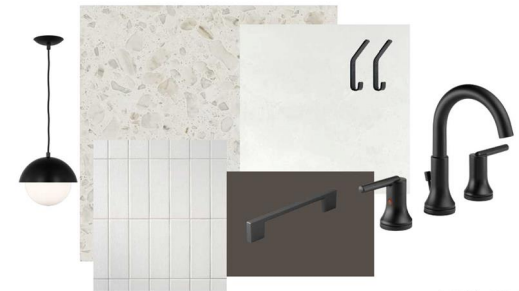
PRIMARY ENSUITE SELECTIONS 2611 25 th Street - Left Side Residence