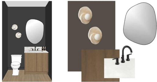
POWDER ROOM SELECTIONS 2611 25 th Street - Left Side Residence