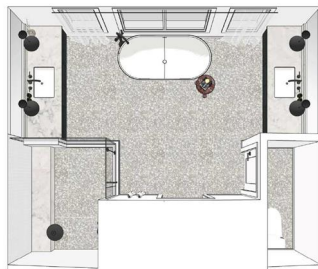
PRIMARY ENSUITE CONCEPT - FLOOR PLAN 2609 25 th Street - Right Side Residence