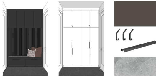
MUD ROOM SELECTIONS 2611 25 th Street - Left Side Residence