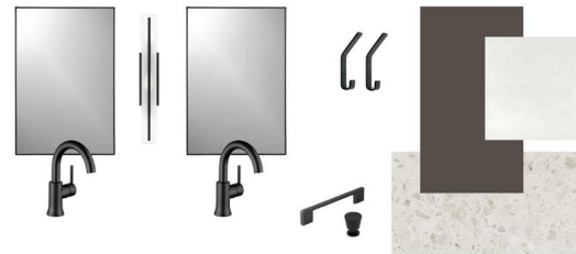
SECONDARY ENSUITE SELECTIONS 2611 25 th Street - Left Side Residence