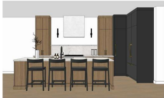
KITCHEN CONCEPT - 3D VIEW 9611 95 th Street - Left Side Residence

TO VIEW THIS PROPERTY WITH AN A-TEAM BUYER'S AGENT PLEASE CONTACT (587) 700-7123