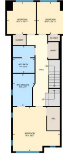
2nd Floor Exterior Area 689.55 sq ft