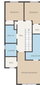
ListSimple 229 Masters Cres SE, Calgary - UPPER 1

Client: Randy Brink January 15, 2023 J&K # 051608