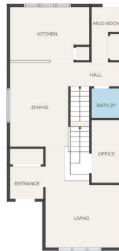
ListSimple 229 Masters Cres SE, Calgary - MAIN

Client: Randy Brink January 15, 2023 J&K # 051608