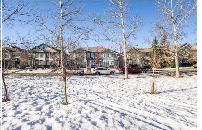
211 Bridlewood Way SW, Calgary, AB

Main Building: Total Exterior Area Above Grade 1315.97 sq ft