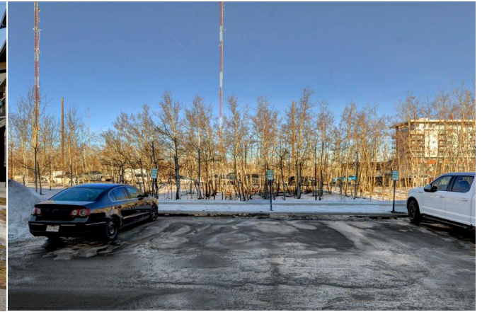
417 Wentworth Row SW, Calgary, AB

Main Floor Exterior Area 679.05 sq ft Interior Area 622.77 sq ft