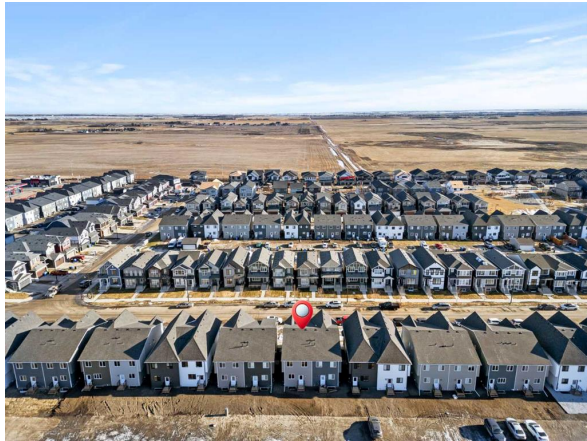
307 Homestead Dr NE, Calgary, AB

1st Floor Exterior Area 852.22 sq ft Interior Area 778.00 sq ft