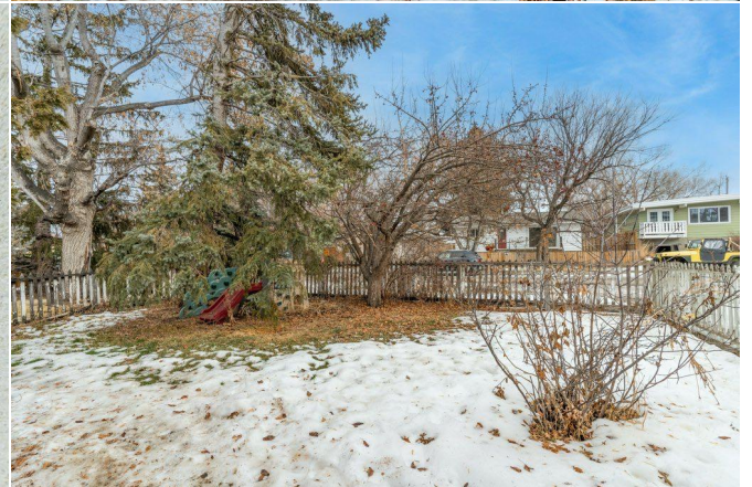
4611 83 St NW, Calgary, AB