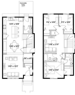
MAIN 801 SQ. FT.