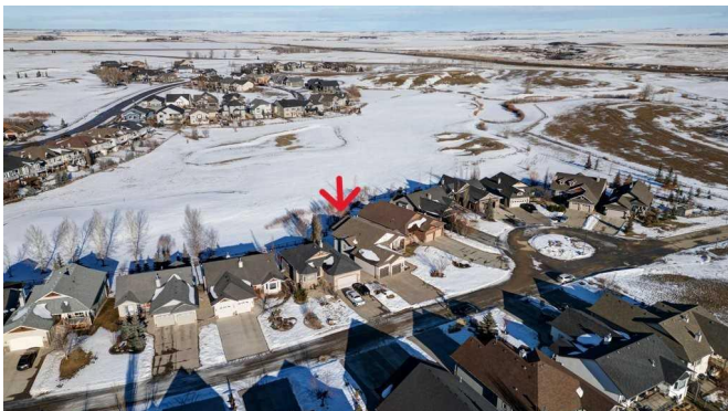
21 Wyndham Park Way, Carlsland, AB

Main Floor Exterior Area 1731.06 sq ft Interior Area 1033.32 sq ft Estimated Area 845.16 sq ft