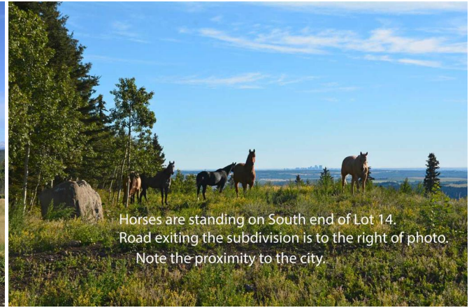
Horses are standing on South end of Lot 14. Road exiting the subdivision is to the right of photo. Note the proximity to the city.