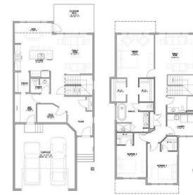
Main Floor 10'0" x 12'0" FT. Upper Floor 10'0" x 12'0" FT. TOTAL - 2000 SQ. FT.