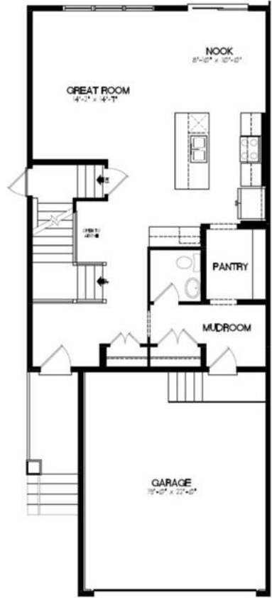
MAIN FLOOR - 864 SQFT