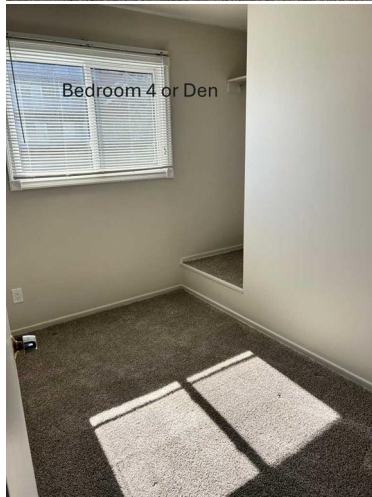
Bedroom 4 or Den