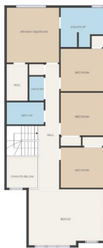
40 Walcrest Row SE, Calgary - UPPER 1