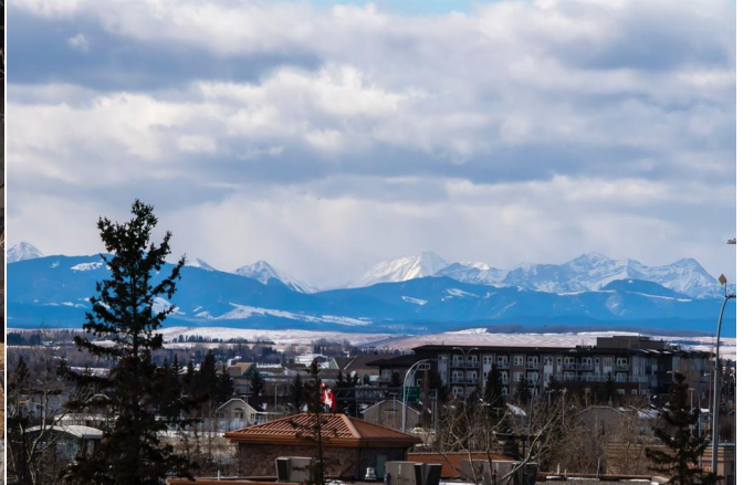
51 Storybook Gardens NW, Calgary, AB

Main Floor Exterior Area 474.51 sq ft Interior Area 452.17 sq ft