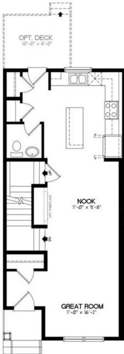
MAIN FLOOR - 695 SQFT