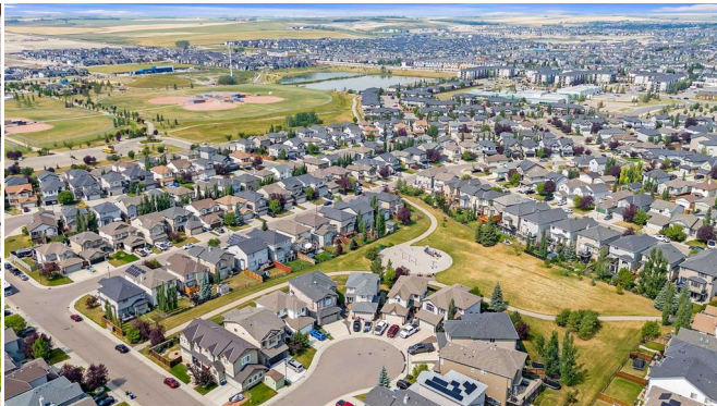
158 Prairie Springs Crescent SW, Airdrie, AB