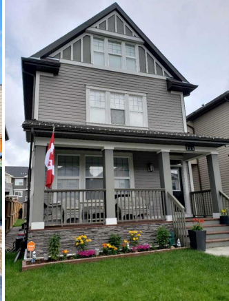
211 Skyview Pt Rd NE, Calgary, AB