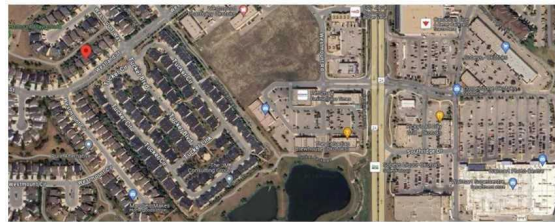
A very short distance to Canadian Tire, Sobeys and Walmart!