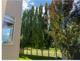
Beautiful Green Private Back Yard