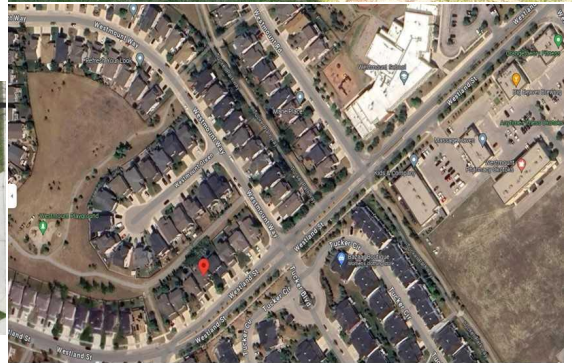
What an amazing idyllic location! A very short walk for your kids to Westmount Playground! Back to school this fall? Your kids can walk to Westmount School and the High School. The commercial area is close but not too close. Just within walking distance!