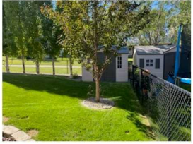
The Sellers meticulously look after their yard!