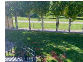
The trees at the back of the property provide a wonderful private area!