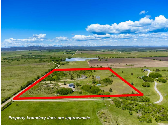
Property boundary lines are approximate