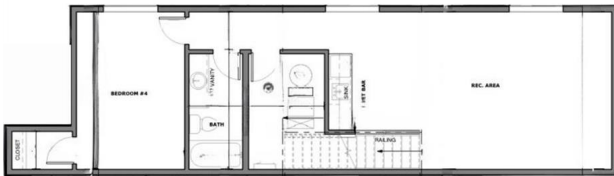
Basement Floor Plan