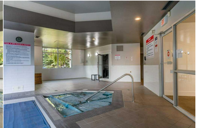
Main Floor Interior Area 874.02 sq ft