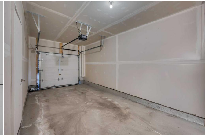
201-140 Redstone Walk NE, Calgary, AB

Main Floor Exterior Area 511.85 sq ft Interior Area 455.15 sq ft