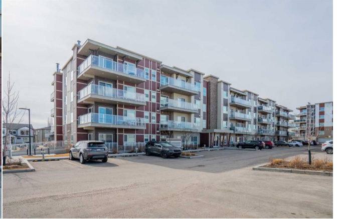
307-300 Harvest Hills Pl NE, Calgary, AB