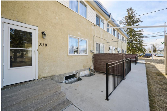
310-2111 Vista Crescent NE, Calgary, AB

Main Floor Exterior Area 561.40 sq ft Interior Area 505.08 sq ft